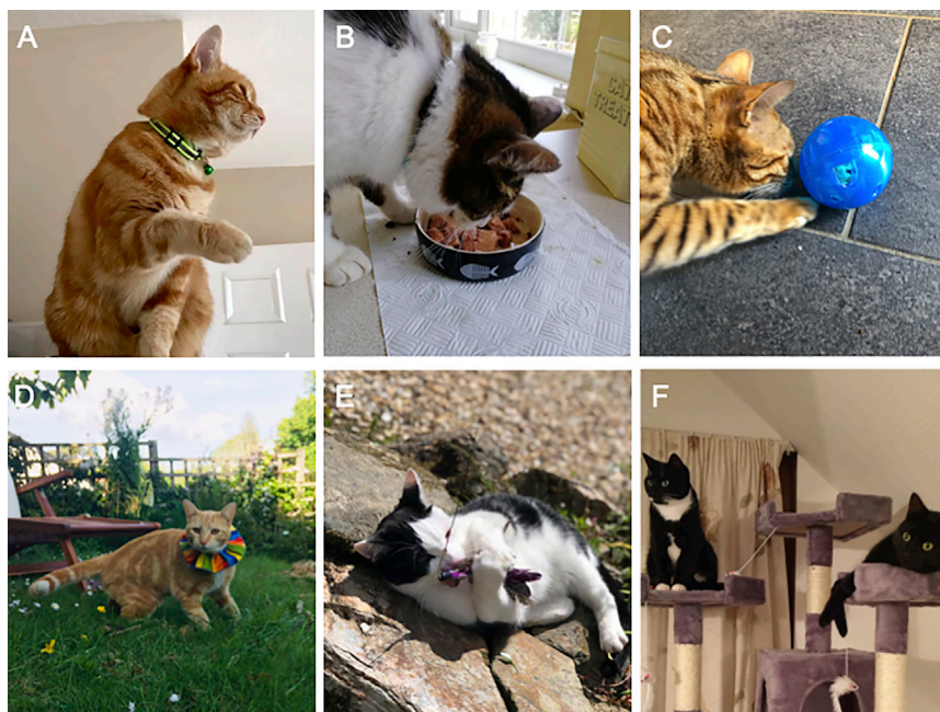
Figure 1. Treatments Applied to Domestic Cats to Reduce the Numbers of Wild Animals Captured, Brought Home, and Recorded by Householders

(A) Bell: cats are fitted with a collar-mounted “standard” cat bell. (B) Food: cats are provided with a high-quality, commercially available food that was high in meat-protein content and lacked grain. (C) Puzzle: provision of existing dry foods in a standard, commercially available puzzle feeder. (D) Birdsbesafe: cats are fitted with a collar and a Birdsbesafe collar cover. (E) Play: cat owners engaged in object play with their cats, using a “fishing” toy (illustrated) and a “mouse” toy for a minimum of 5 min/day. (F) Control: owners only recorded the numbers of wild prey brought home every day.